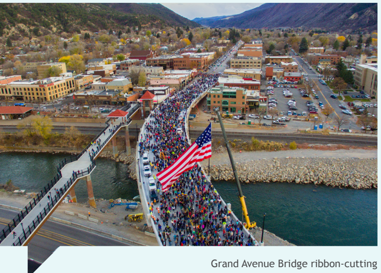
ceremony in Glenwood Springs