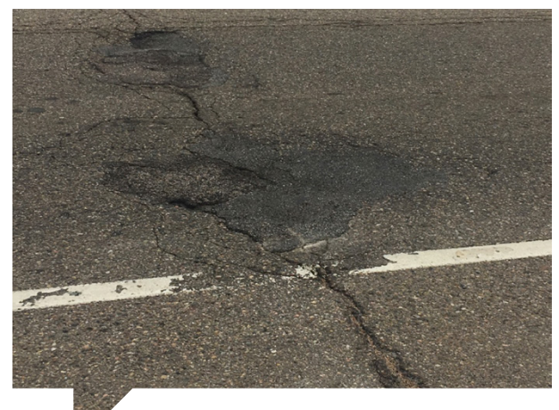
Poor pavement along a state highway

1 Reason Foundation, 2019 Annual Highway Report, Colorado's Performance and Cost-Effectiveness Rankings 2 Colorado State Demography Office